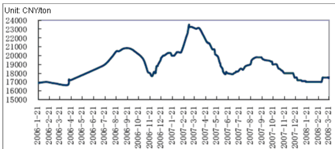
EX-factory Price Trend of BDO, 2006-Mar. 2008

For the sharp increase of demand from downstream industries in the first quarter of 2007, especially from the booming spandex market, BDO demand increased greatly. However, some BDO production units of companies such as Shanxi Sanwei Group Co., Ltd. were under maintenance, which caused insufficient supply, thus pushed the price rise. Up to the end of March 2007, the price has hiked to CNY 24,000/ton. Afterwards, with the release of BDO capacity and strengthened sales of overseas manufacturers, the BDO price in China fell to be CNY17, 000/ton.