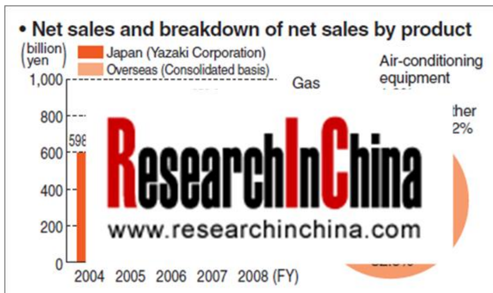
Revenue of Yazaki in Japan and Foreign Countries, FY2004-FY2008

Established in 1941, Yazaki has 437 branch offices in 39 countries. There are 157,100 employees in the company, of which, 22,000 works in Japan. Yazaki is the largest private unlisted company in the world. The fiscal year of the company ends with late June. As the world’s biggest automotive wiring harness manufacturer, the auto parts business represents 83% of its revenue. Meanwhile, the company also engages in the production of auto electronics, auto instruments, auto traveling data recorders, taximeter as well as wires.