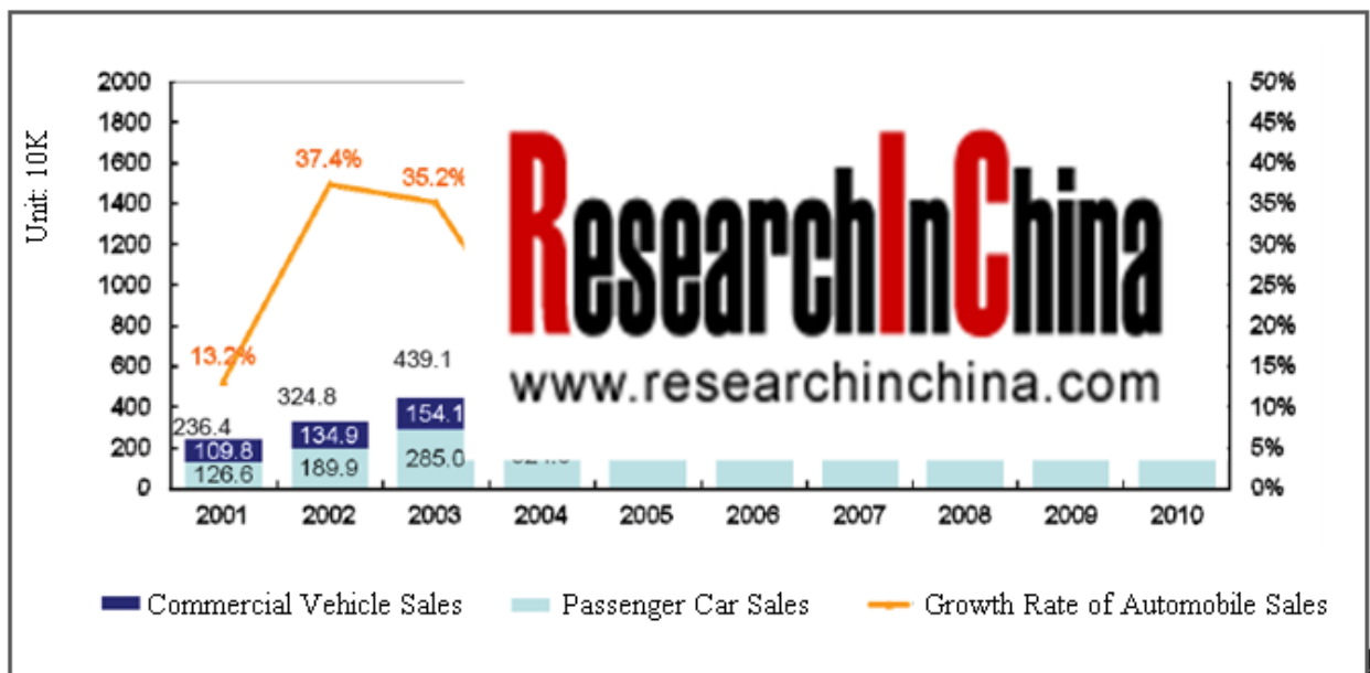
China's Automobile Sales Volume, 2001-2010

In 2010, Chinese automobiles witnessed **** million and **** million in its full-year production and sales, year-on-year up by 32.44% and 32.37% respectively. Of which, **** million and **** million respectively for the passenger cars, growing by 33.83% and 33.17% separately; and **** million and **** million for commercial vehicles, rising by 28.19% and 29.90% correspondingly. So all the models achieved all-round progress in 2010 and the automobiles production and sales kept the hot trend in 2009, with automobile population nearly **** million and a higher market share of the self-owned brand.